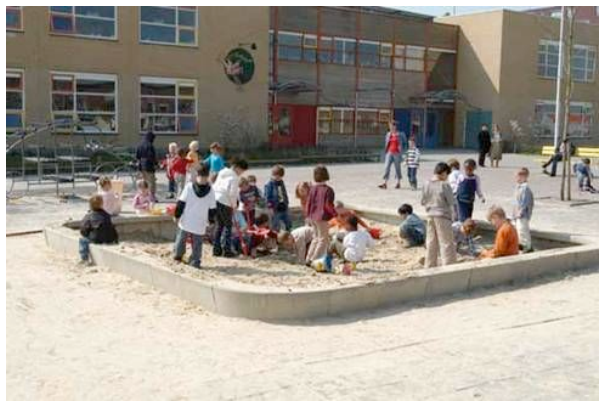
This is Hitoog Elementary School: