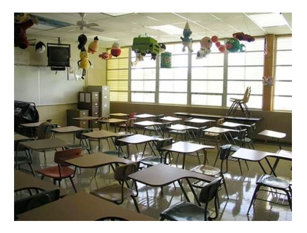
This is the class room of Hitoog Elementary School: